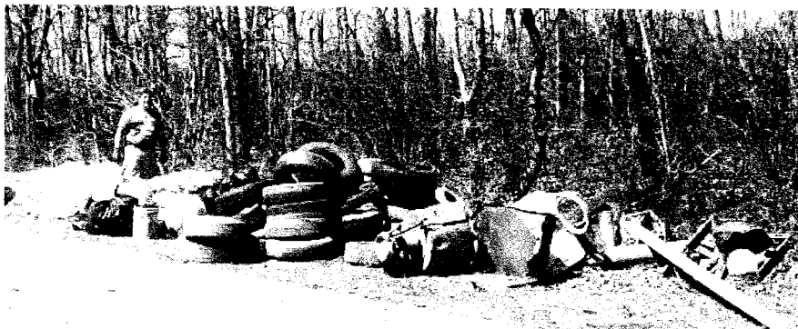
Stan Hershey, event coordinator, stands with pile of trash, recyclables, and tires

The Road and Stream clean up on the Oldman's Creek/Pedricktown Marsh was a great success. A total of 30 volunteers (adults and children) met at the parking lot on Pedricktown-Center Square Road next to Oldman's Creek on Sat April 9th at 9AM and worked very hard collecting a variety of items. Thanks to all who participated!